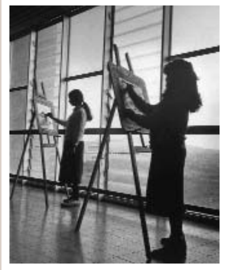
Painting the View, Eisenberg H.S. 1980