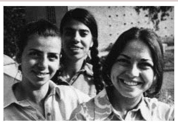
Three Smiling Faces, Mosad Aliyah 1970