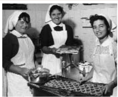
Baking Class, Jerusalem 1960