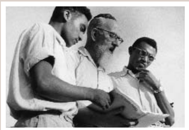
Rabbi and Two Students Study Text on Jewish Festivals, Kfar Batya 1957