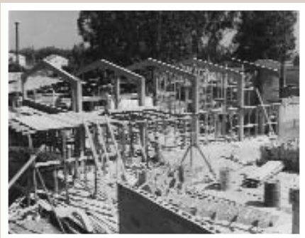
Construction of New Buildings, Mossad Aliyah 1957