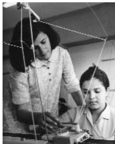
Weaving Class, Beersheva 1970