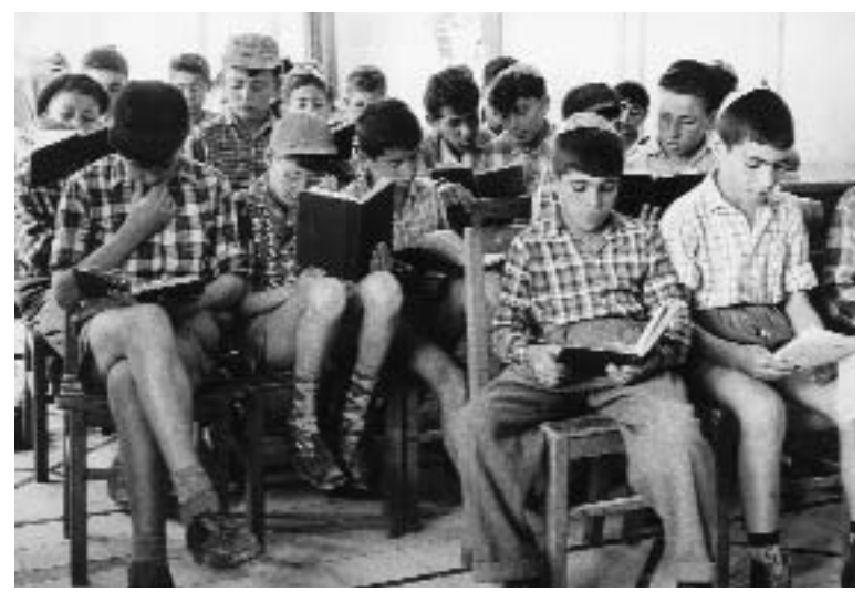
Boys Minyan, Haifa 1960