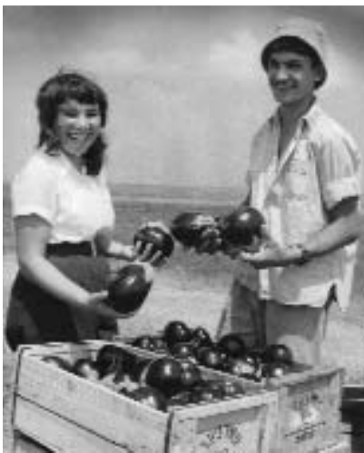
Eggplant Harvest, Kfar Batya 1957