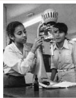
Adjusting Microscope, Kfar Batya 1980

ing of the exiles," to have been able to preserve a photographic record of these monumental times for others to see.