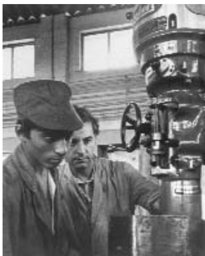
Instructor and Student with Machinery, Kfar Batya 1980