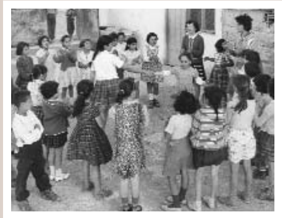
Girls Dancing in a Circle, Bakka Settlement House 1960

Leni traveled to AMIT schools throughout Israel, making repeated trips from 1950 through the '60s and '70s, and even a last visit to a number of