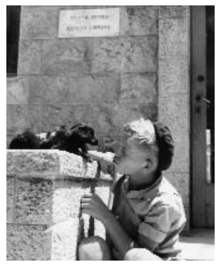
Boy and Puppy, Jerusalem 1957