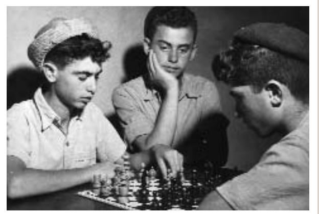
Chess Game, Mosad Aliyah 1953