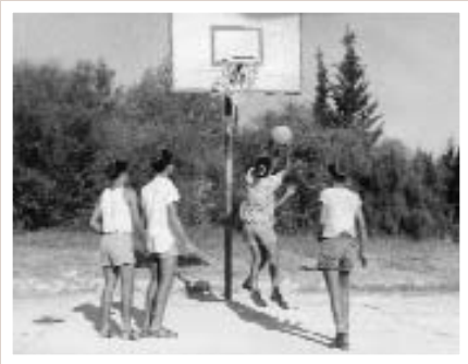
Afternoon Basketball Game, Mosad Aliyah 1957