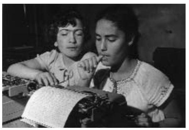
Girls at Typewriter, Jerusalem 1953