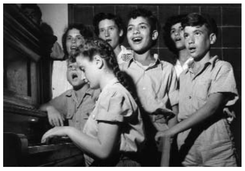
Children Singing, Mosad Aliyah 1953