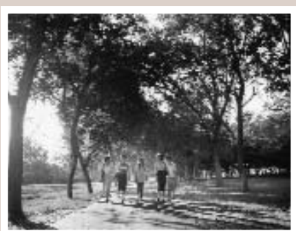
Girls Walking, Kfar Batya 1980